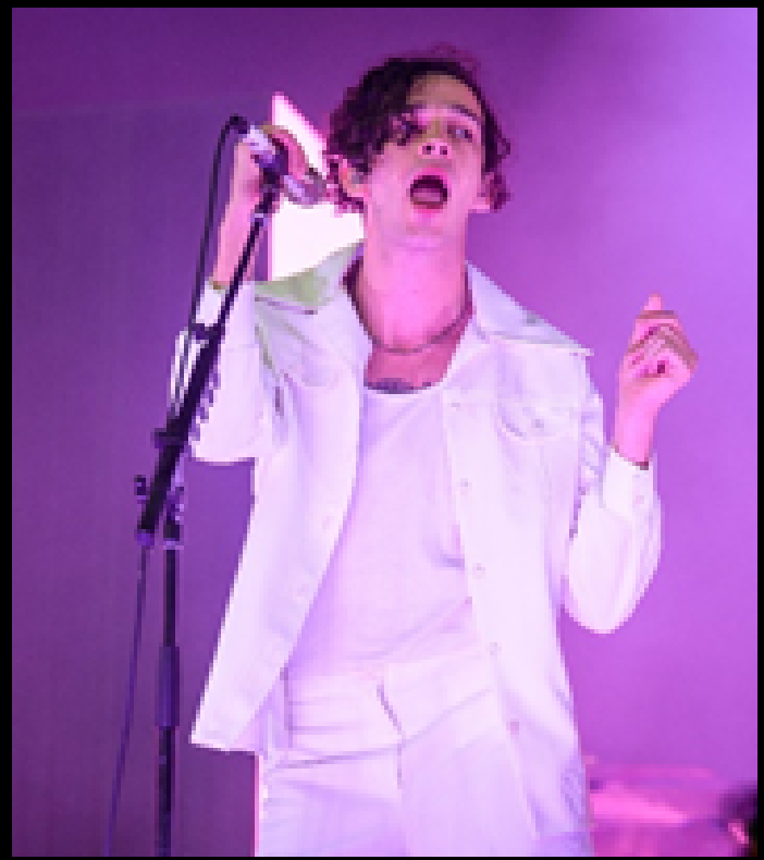
The 1975 @ Rock im Park 2016

'A Brief Inquiry Into Online Relationships', The 1975 's third album their song 'Surrounded by Head and Bodies' is a connection to David Foster Wallace's novel Infinite Test Matty found the novel on the first page where the title of the song was formed from the literal opening lines from the book. Literary influence also flows into the artist's personal lives with singer Matty,