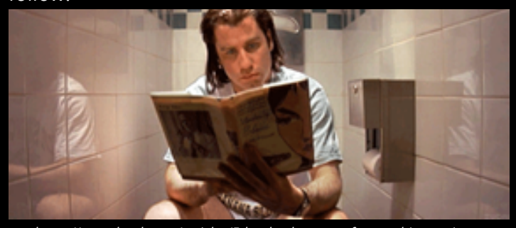
https://manybooks.net/articles/5-books-that-were-featured-in-movies '5 Books That Were Featured in Movies'

This article focuses on the difficultly that new readers, or unexperienced readers, have with kickstarting their journey into discovering literature that they can enjoy. My advice here, is to stick with what you know until you are ready for something else. By reading the book adaptations of your favourite films, you already know that you love the storyline and the characters, and it will be easier to follow.